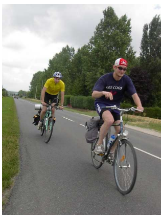
The easy side of the hill

On the way, our team took part in one of the stages of the « Beach Rugby Tour » organized by the French Rugby Federation, at Montalivet les bains (33), on July 30, 2004. Our Team managed its way to the Final in this tournament that gathered over fifteen teams.