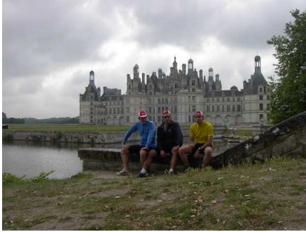
Resting in Chambord (41)