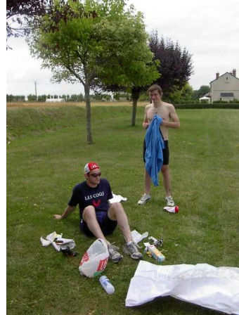
Lunch break at Châtillon du Indre (36)