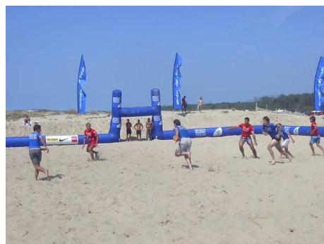
Quarter final of the Beach Rugby Tour 04 in Montalivet (33)